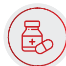
Health and pharma