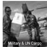
Military & UN Cargo