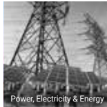
Power, Electricity & Energy