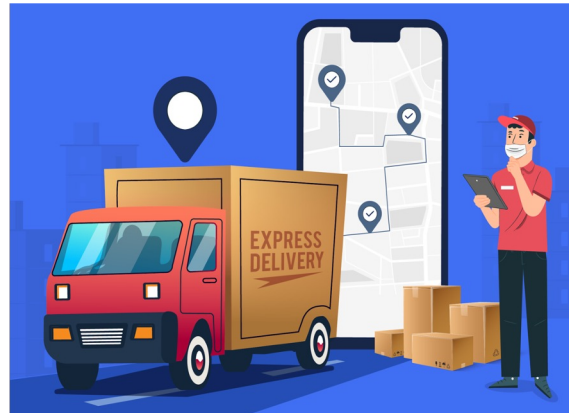
Last mile delivery