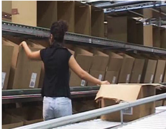
Pick n Pack