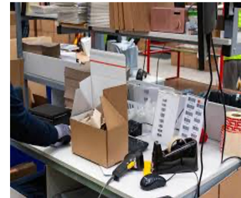
Kitting & labelling