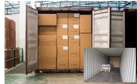
Loading and inspection