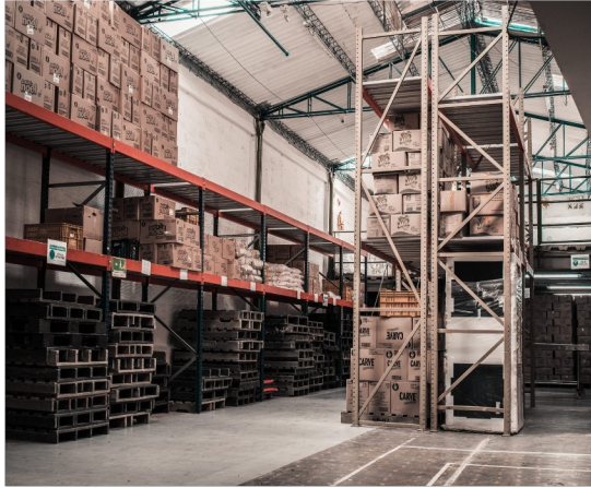
Storage and Warehousing