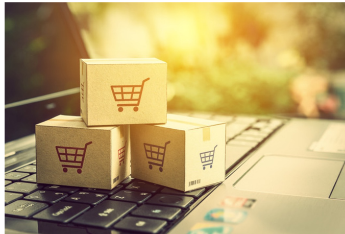
Order, Purchase and Procurement